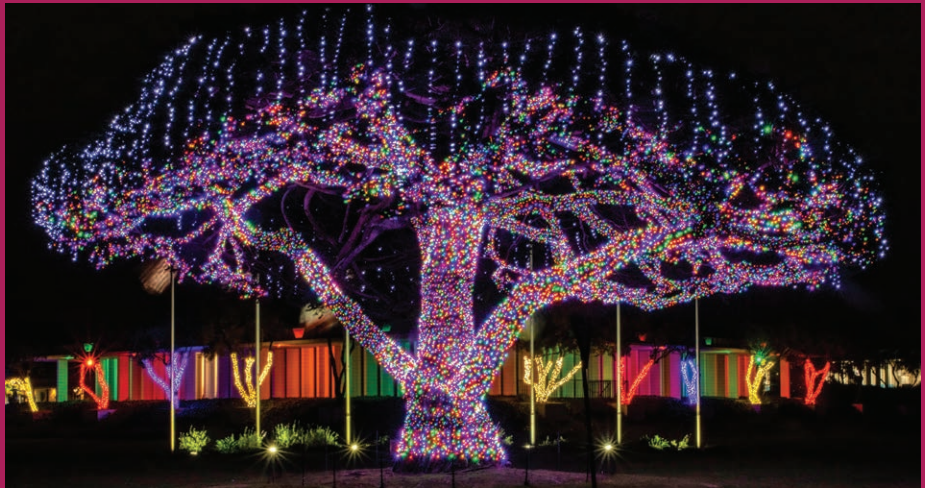
Trees provide vital habitat for wildlife, but when they are lit like this few animals can use them.

Find more details on any of the research listed in this report by checking our References section on p14.