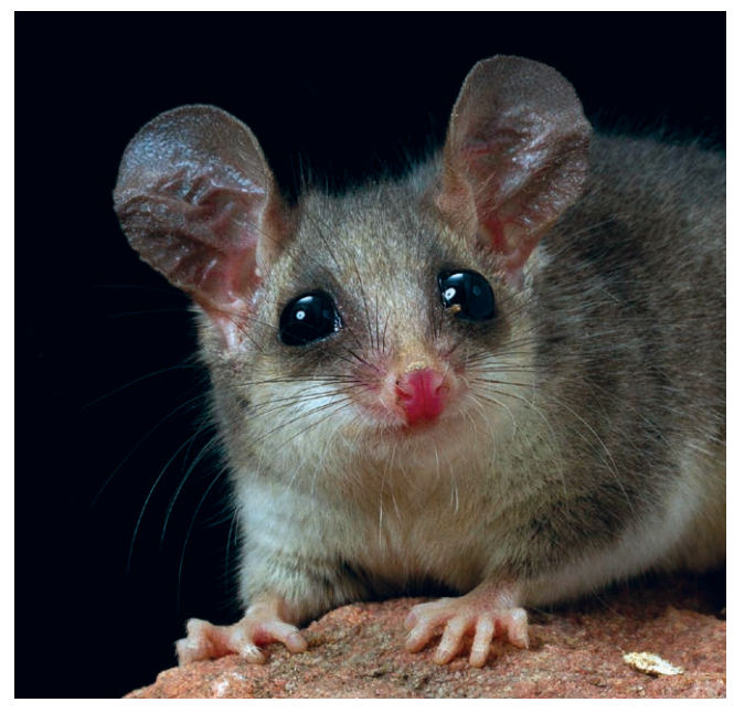
Eastern pygmy-possums reduce their activity when there is more night light.