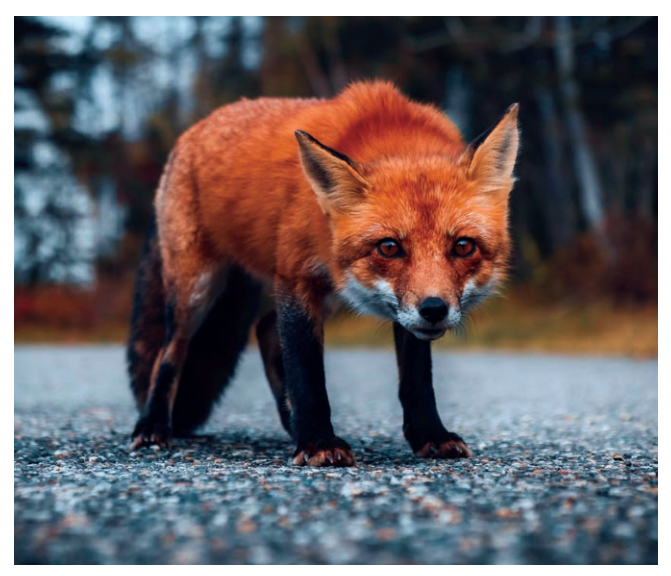
Smaller ground dwelling native animals use dark habitat to avoid being spotted by predators like the invasive European red fox.

Some reptiles and frogs can also be attracted to the invertebrates that are attracted by artificial light including under street lights, which increases the likelihood of car strikes.<sup>8</sup>