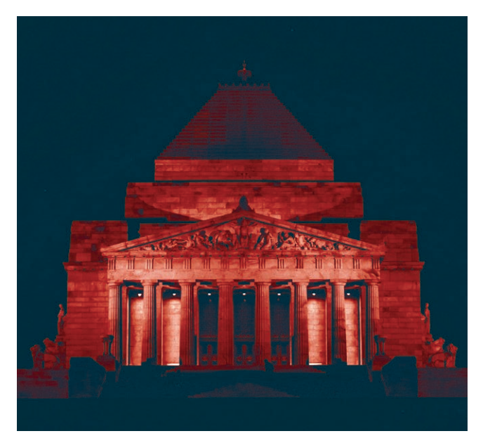
Light displays are best reserved for public places that can be enjoyed by many. Red and amber lights also minimise impacts on wildlife.