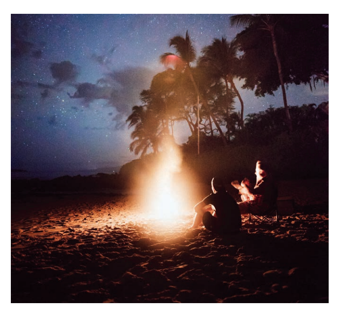
Bright lights on beaches, inclusing fires, often lead to the deaths of baby turtles and seabirds if they are in the area, so avoid them whenever possible.

Turning off unnecessary lights and dimming ones that need to stay on makes a big difference.