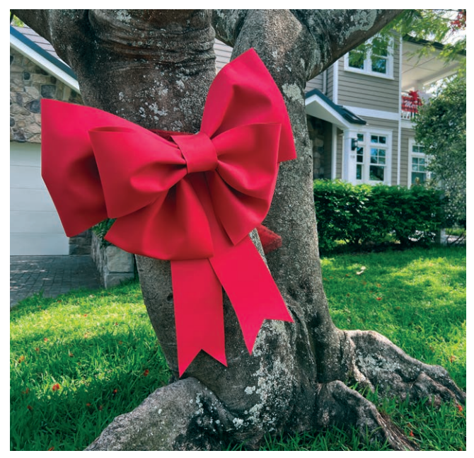
Daytime decorations are a great way to be festive without contributing to light pollution.